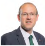
Llyr Gruffydd AC